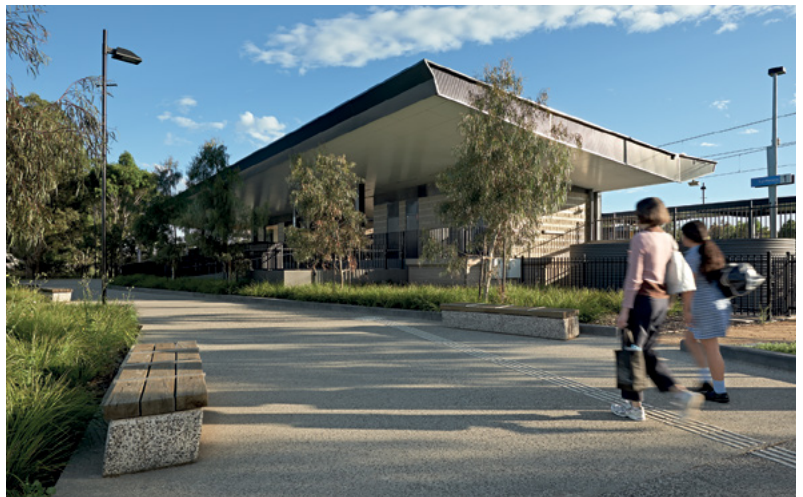
02. Lynbrook Road Railway Station